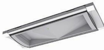
Ceiling Bracket F65 Extreme - 19049