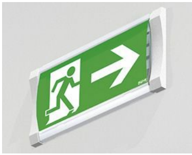
Adhesive Left/Right/Down - 19044