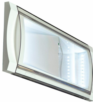
Formula 65 LED Extreme