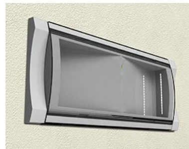
Recessed Box -- Frames F65 Extreme - 19048