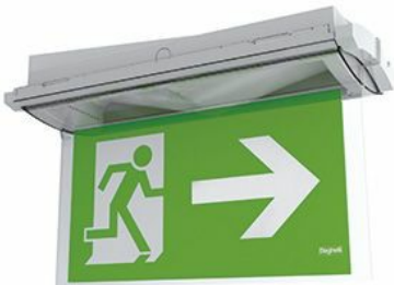
Wall Bracket - 19049 -- Double Sided Screen with Left/Right Arrows - 19042