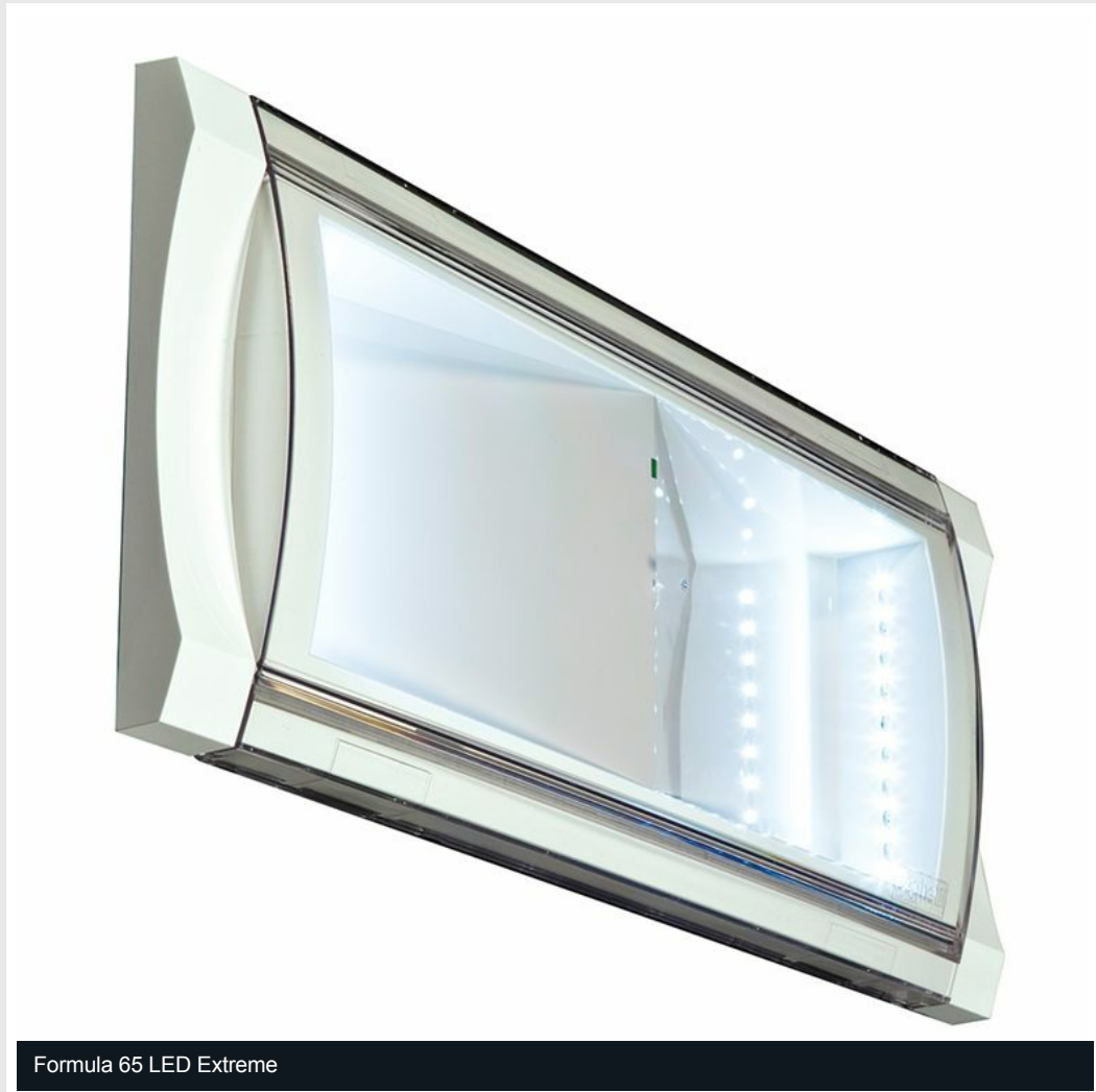
Formula 65 LED Extreme